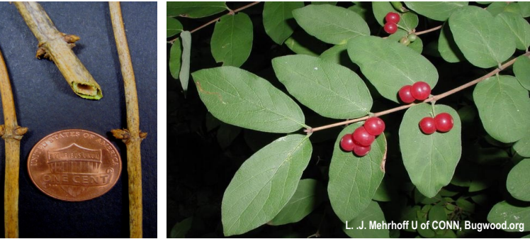
L. J. Mehrhoff U of CONN, Bugwood.org

LEAVES: In pairs, oval or oblong, smooth edges, up to 2.5 in long. Hairiness varies. STEMS: Bark shaggy, tan-gray. Twigs are hollow, whereas native bush honeysuckles have solid twig centers. Branches spread at low angles from the base. Winter buds stubby, in pairs. FLOWERS: In pairs, ½ in long, white, yellow, or pink. Late May–June. FRUITS: In pairs, spherical, ¼ in across, yellow, orange, or red. Not edible. HABITAT: Old fields, floodplains, forest edges and roadsides. Does not thrive in deep shade. Can survive on shallow soils. IMPORTANT CONSIDERATIONS: Fruits usually gone by fall. Common buckthorn often found establishing under bush honeysuckles. Roots are shallow, smaller plants can be pulled out of loose soils. “RESTRICTED” under MN law as of 2018.