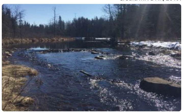
Rock weir at the outlet of Big Rice Lake in 2016.