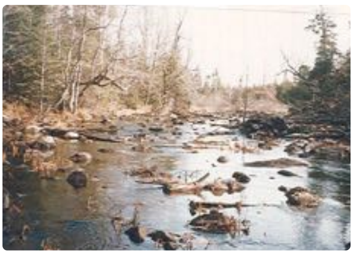
Natural rock rapids at the outlet of Big Rice Lake in 1992.

Since 2006, a cooperative effort of several federal, state, and tribal partners has taken additional management activities to further support Manoomin (Vogt, 2020). In addition to allowing water levels to vary naturally, natural resource managers are cutting ginoozhegoons. Natural resource managers use an airboat with chains to disturb the substrate of Big Rice Lake to encourage the germination of Manoomin seed in several test plots (Vogt, 2020). These efforts control about 100 acres of ginoozhegoons each year, but Manoomin regrowth in cut areas has been minimal (Vogt, 2020). Over the years, partners have also trapped beavers and removed beaver dams to control water levels.